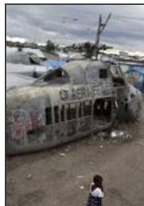
IoS Christmas Appeal