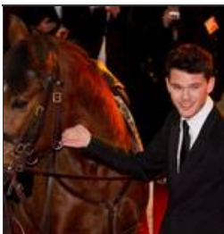
Exercise in schmaltz in search of magic