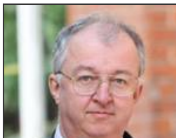
Self-styled 'love rat of the year' who became scourge of adulterers