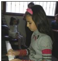
A composition in defiance and harmony